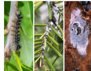
Uninvited Guests in Your Trees: Three Invasive Threats to Watch for in 2026