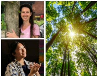
Roots and Horizons: A Conversation Looking Back and Growing Forward