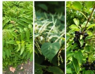
Grow Me Instead: Native Alternatives to Three Common Invasive Species